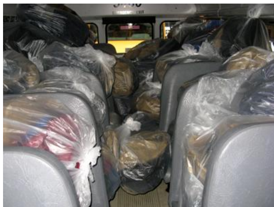
Bus load of supply-filled backpacks

Partnering this year with HCEF were CBL Properties, Diocese of Pittsburgh's Catholic Youth Ministry Co-ed Softball Championship Tournament and Youth & Adult Ministry, Kenny's Club and Paige's Promise, Iota (Pittsburgh) Chapter Alpha Delta Kappa Sorority, rue21, inc, and — as always — many individual donors.