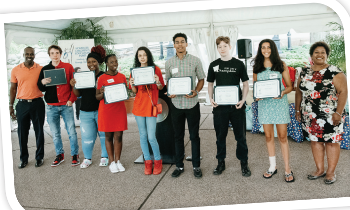
▲ OUR 2021 HOPE THROUGH LEARNING AWARD RECIPIENTS