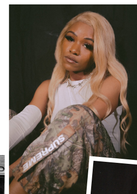
◀ SELF PORTRAITS TAKEN DURING THE TEENIE HARRIS WORKSHOP

If your organization would like to support a future community outing, email us at info@homelessfund.org .