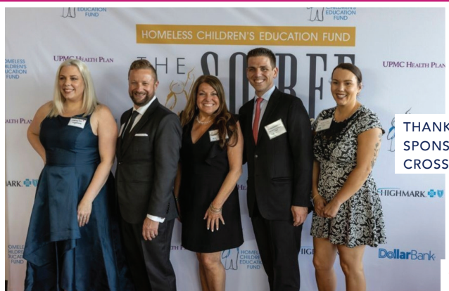
THANK YOU TO PLATINUM SPONSOR, HIGHMARK BLUE CROSS BLUE SHIELD!