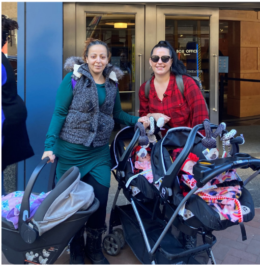
▲ TWO OF OUR FABULOUS MOMS OUTSIDE THE O'REILLY THEATER

At HCEF, we know housing instability happens to the whole family. And we make certain the entire family unit receives some form of support and care. We are grateful for our partnership with Dollar Bank for making that a reality!