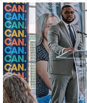
▲ THE HONORABLE AUSTIN DAVIS, PA LT. GOVERNOR KICKS OFF THE POLICY BREAKFAST