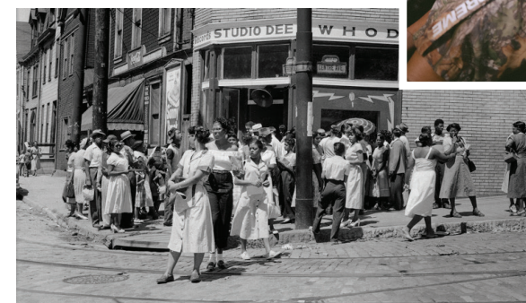
▲ SMALL CROWD GATHERED OUTSIDE STUDIO DEE, WHOD RADIO STATION, HERRON AND CENTRE AVENUES, HILL DISTRICT, AUGUST 1, 1951.