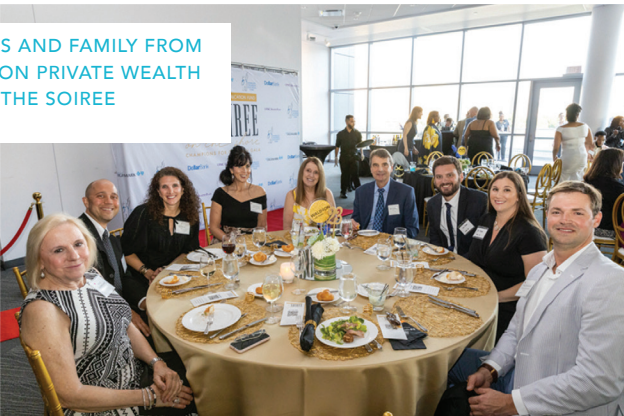
FRIENDS AND FAMILY FROM WALDRON PRIVATE WEALTH ENJOY THE SOIREE