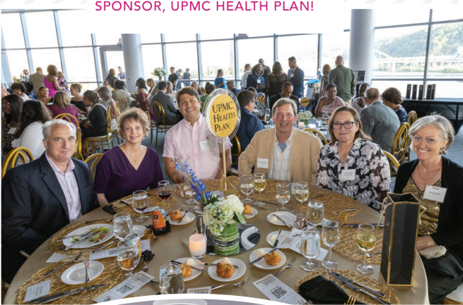
THANK YOU TO PLATINUM SPONSOR, UPMC HEALTH PLAN!