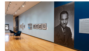
▲ THE CHARLES 'TEENIE' HARRIS ARCHIVE AT THE CARNEGIE MUSEUM OF ART