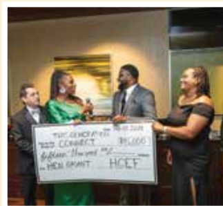
▲ THIS GENERATION CONNECT IS HONORED AS THIS YEAR'S RECIPIENT OF THE COLLABORATIVE IMPACT GRANT