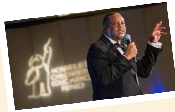
▲ MAYOR ED GAINEY GIVES A STIRRING SPEECH